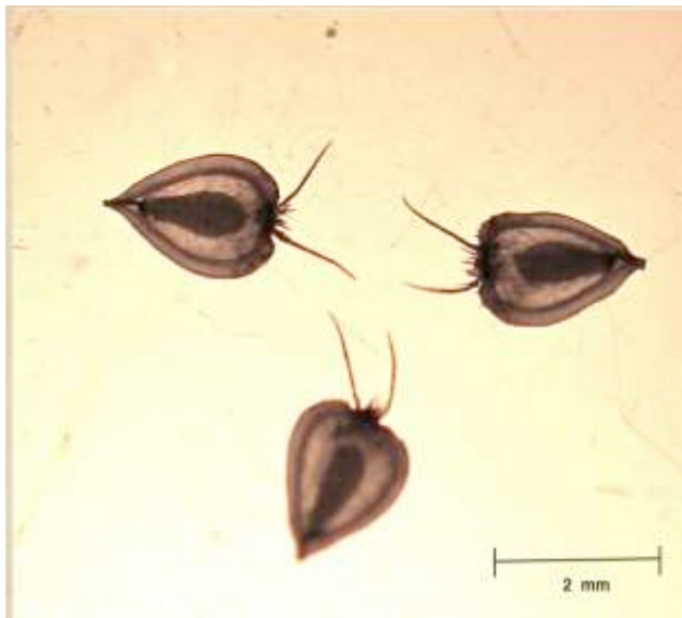
Boltonia decurrens (decurrent false aster) seeds – one of two kinds of seeds produced by the plant. Note the crown of irregular awns with two larger ones resembling antennae.

The group then moved on to the Jones-Confluence State Park just a few miles down the gravel road. Exploring big river bottomland, a wide variety of plants were noted including: Desmanthus illinoensis (Illinois bundle flower) with its characteristic spherical clusters of curled brown seed pods, unusually large specimens of remnant Ambrosia trifida (giant ragweed), and Symphyotrichum pilosum (white heath aster), Solidago altissima (tall goldenrod), and Lycopus americanus (American bugleweed). They obviously find the habitat to their liking. Based on the findings at the stop near the Locks and Dam, the group was keeping an eye out for Boltonia decurrens in this area also. There were several examples of what could have been a Boltonia , a Helianthus sp., or ?, but no conclusion could be reached with the material at hand.