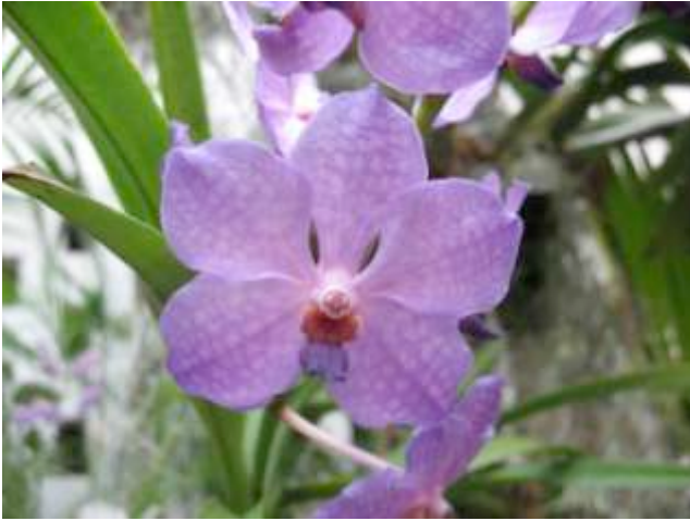
Ascocenda Navy Blue.

We wandered the display, which this year is inspired by a French "Butterfly's Garden," entering through a Parisian-style café, "Café de Monarque," and through the main room where the delightful electric trains this year travel by recognizable Paris locations to a soundtrack of French music. (For a small sample of what we saw, visit http://www.youtube.com/watch?v=kuhdW_t00_E ). The staff starts with about 800 plants and switches out approximately 50 to 100 plants each week, replacing them with fresh blooms from the greenhouse. The display is meant to look as natural as possible, with epiphytic orchids growing in trees and terrestrial orchids growing along the ground. The temporary landscape is surrounded by bark with a surface treatment of moss to give a feeling of being in the tropics.