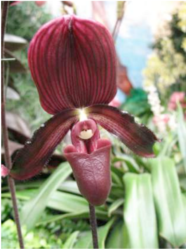
Paphiopedilum Maudiae (Dark Form).