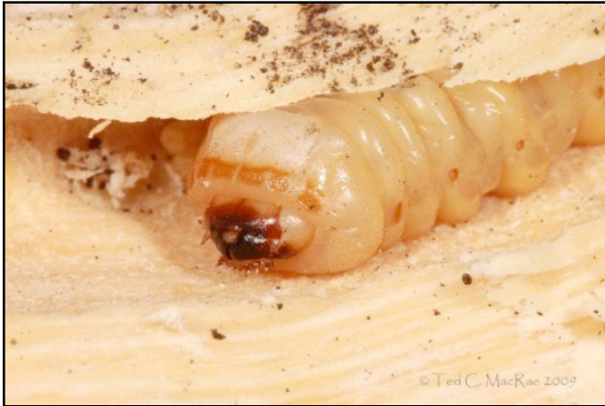
Plinthocoelium suaveolens larva in root of living Sideroxylon lanuginosum .

Sideroxylon , especially one as large as this based on the size of the frass pile. I hurried back to the truck and grabbed my hatchet, returned to the tree, and scraped away the soil above the root to find an obvious ejection hole a few inches away from the base of the trunk. I started chipped into the root at the ejection hole and found a large, clean gallery extending down the center of the root away from the trunk. About 18" away from the trunk I found it—a large, creamy-white cerambycid larva.