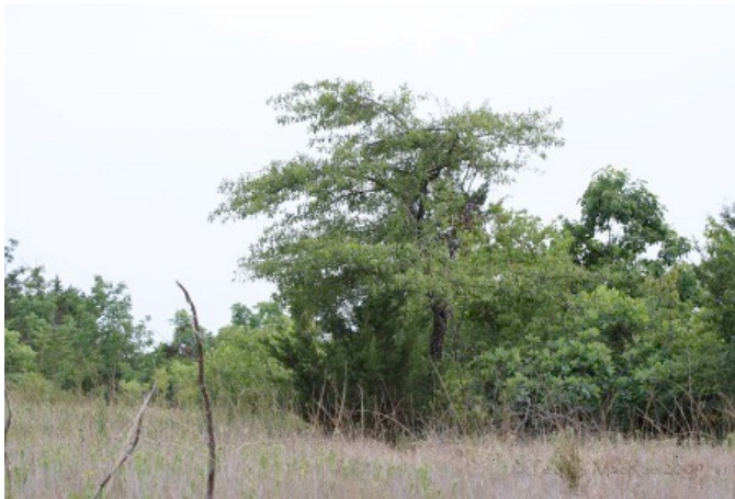
Sideroxylon lanuginosum (gum bumelia) at Blackjack Knob, Taney Co., Missouri.

Missouri on the first day of a planned 3-week search, my attention immediately turned to the new goal of finding P. suaveolens and photographing it on its host plant.