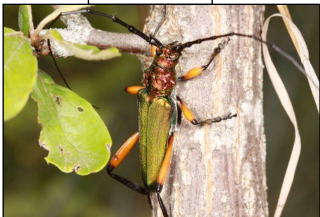
Plinthocoelium suaveolens adult on lower trunk of living Sideroxylon lanuginosum .

Mexico) by the bronze or cupreous tints and weak transverse rugae on the pronotum (Linsley 1964). The distributional ranges of the two subspecies intermingle in northeastern Texas