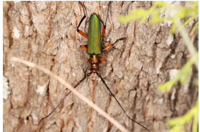
Plinthocoelium suaveolens on lower trunk of living Sideroxylon lanuginosum .

gave me the motivation to resume my search, but no additional beetles were seen before a dropping sun put an end to the day.