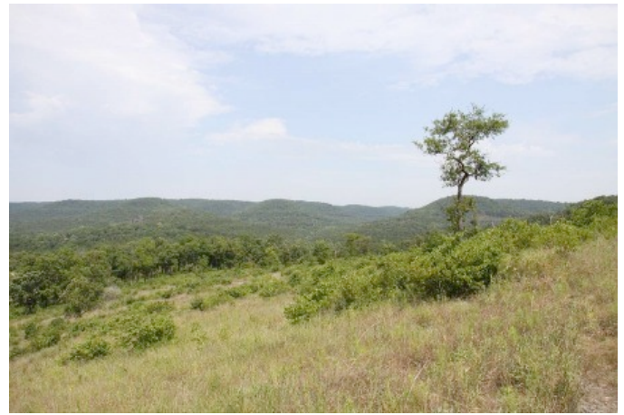
Chute Ridge Glade, Roaring River State Park, Barry Co., Missouri.

My reason for returning to the White River Hills this year was simple—find and photograph the magnificent longhorned beetle, Plinthocoelium suaveolens (family Cerambycidae). This species, occurring across the southern U.S. from Florida and Georgia west to New Mexico and Arizona, is truly one of North America's most beautiful longhorned beetles due to its large size, brilliant iridescent green coloration, and super-elongate