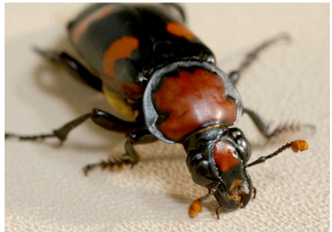
American Burying Beetle, Nicrophorus americanus .

ABB was once a widespread species throughout the central and eastern United States. Today there are a few remnant populations located in Rhode Island, central Nebraska, eastern Kansas, eastern Oklahoma and western Arkansas. No one has a clear understanding of why there are so few beetles remaining. Some interesting possibilities include: fragmentation of habitat favorable to other scavengers; appropriate size carcasses used for food (prairie chickens, bobwhite and passenger pigeons) are extinct or no longer plentiful; and light pollution. There appears to be a correlation between the location of remaining ABB populations and where people are not. It is thought that outdoor lighting may disorient the beetle so that it cannot behave naturally.