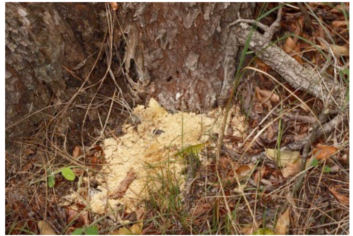
Plinthocoelium suaveolens larval frass pile at trunk base of living Sideroxylon lanuginosum .

The remnant glades at Blackjack Knob are more extensive than those at Chute Ridge, so many more trees still awaited examination—if I could