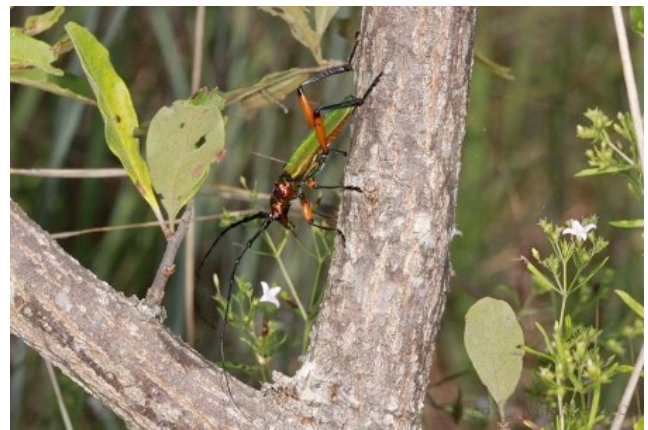
Plinthocoelium suaveolens adult on lower trunk of living Sideroxylon lanuginosum .

the day and spent a bit of time chasing after some enormous robber flies that later proved to be Microstylum morosum , a new record for Missouri and a significant northeastern range extension . I thought that would be the highlight of the day, but as we were heading back to the car I spotted a small glade relict on the other side of the road. It was overgrown and encroached, apparently not receiving the same management attention as the glades in the main complex. Regardless, I went over to check it out and immediately spotted several bumelia trees amongst the red-cedars, and within minutes I saw a beetle—low on the trunk of a very small bumelia tree! Once again I froze, then slowly geared up with the camera and began my ultra-cautious approach (remember, this was only my second photo chance after a combined four days in the field). Like last time, I took one shot while still some distance away, then moved in for closer attempts. Unlike last time, there was no