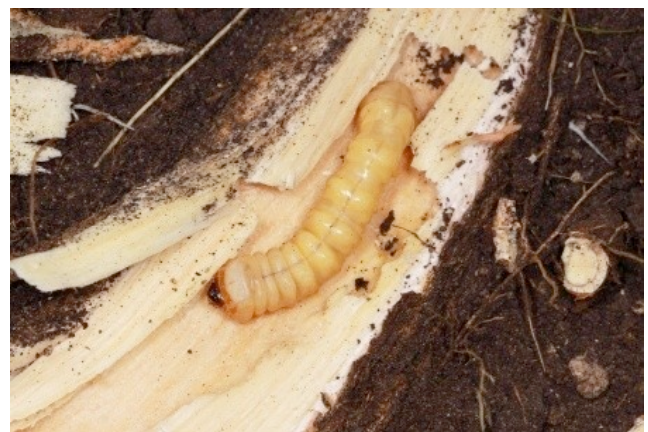
Plinthocoelium suaveolens larva in root of living Sideroxylon lanuginosum .

only muster the energy! I trudged back to the truck, guzzled a nice, cold Powerade, and started off in another direction. I looked at a number of trees and still had seen no sign of the beetle, but on one particular tree I noticed an enormous pile of sawdust on the ground at the base of the tree. I looked at it more closely and saw that it had the rough, granular texture so characteristic of longhorned beetle larvae that like to keep their galleries clean, and its bright, moist color suggested that it was being ejected by a larva tunneling through living wood. I looked up into the tree above the pile to find where it was coming from but could find no ejection hole. I checked the base of the trunk itself and still couldn't find anything. Then I started poking into the pile and felt a root. Further poking revealed a soft spot on the root, and I immediately knew that I had found a P. suaveolens larval gallery—no other cerambycid species is known to bore in roots of living