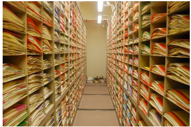
Missouri Botanical Garden Herbarium shelf units.

We then went to the fourth floor to visit the Missouri Botanical Garden Library, one of the world's finest botanical libraries. Founded in 1859 by Henry Shaw, the library is an essential part of the Garden's research program. It is used in conjunction with the herbarium by Garden research staff, botany students, and visiting scientists from around the world. The general collection consists of more than 200,000 volumes of monographs and journals. More than 800 current periodicals are received through subscription and on exchange. The main emphasis of the collection is on plant taxonomic literature, current and retrospective, collected in all languages. Other special collections include: over 3,000 reference works; 1,100 Sturtevant Pre-Linnaean volumes; 2,000 post-1753 rare books; over 1,000 folio volumes; the personal collections of Ewan (11,000 books), Steere (1,000 volumes), and Niederlander (600 volumes); 7,000 items of botanical art; map and atlas collection (over 7,000 items); and microfiche (45,000 records). A sample of the historic botanical literature from the Missouri Botanical Garden Library may be viewed online at http://www.botanicus.org/ .