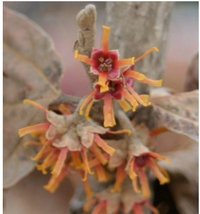
Hamamelis vernalis flowers.

a healthy population of this species. Indeed, the witch hazel was in bloom, the pleasant fragrance being evident as we explored the area. Most other plants that we identified were still in their dormant state or were last year's senescent growth. These included Hypericum punctatum (spotted St. John's wort), H. prolificum (shrubby St. John's wort), Euonymus atropurpureus (wahoo), Amphicarpaea bracteata (hog peanut), Trichostema brachiatum (fluxweed), Ruellia strepens (smooth ruellia), Penstemon digitalis (beard-tongue), Elephantopus carolinianus (Carolina elephant's foot), Dasistoma macrophylla (mullein foxglove), and Monarda fistulosa (wild bergamot). Senescent grasses included Andropogon gyrans (Elliott's broom sedge), A. virginicus (broom sedge), and Diarrhena americana