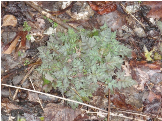
Polymnia canadensis (leafcup).