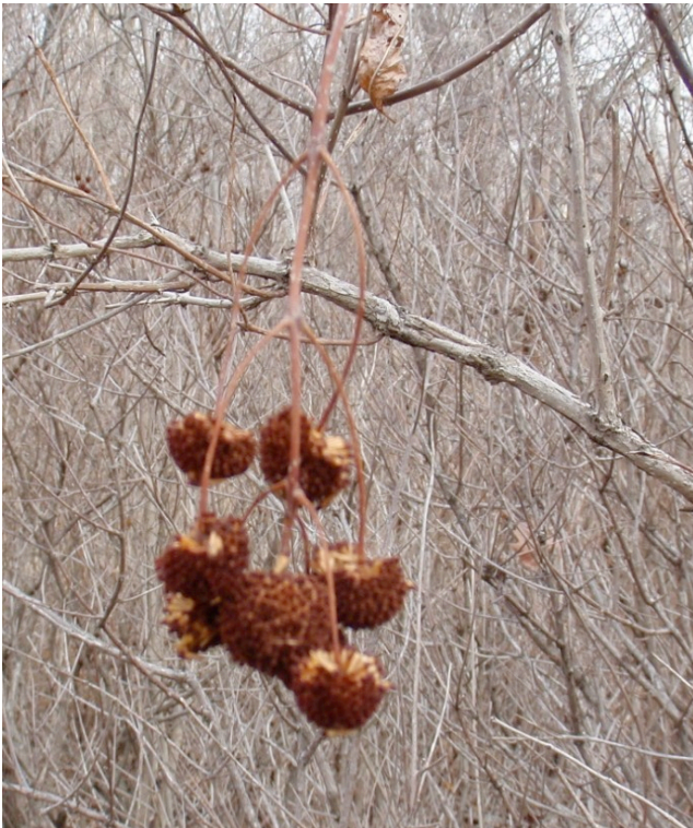
Cephalanthus occidentalis (buttonbush) seedheads.