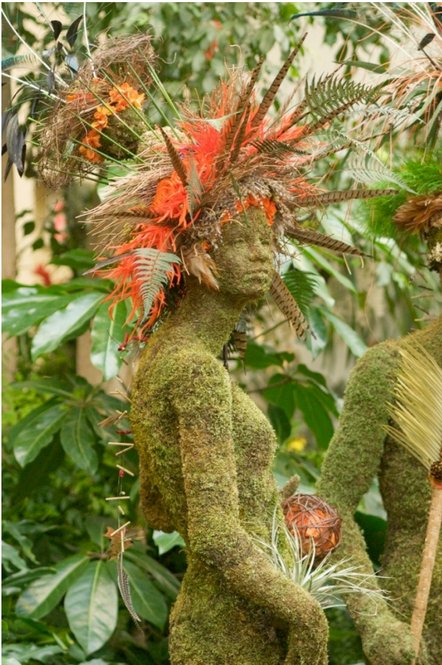
Dressed for the occasion! A Mayan figure in the 2011 Orchid Show, Missouri Botanical Garden.

Accordingly the floral display was occasionally punctuated by elegant life sized Mayan male and female figures whose patina (on classic statues) was replaced by a surface of mosses (in texture and color). Each figure apparently patronized the same milliner and was crowned with a regal and colorful assemblage of ferns, feathers, orchids, and a various other stylish foliage. And if one should raise their eyes in amazement of this spectacle, he or she would be greeted by aerial displays of plant materials sculpted into parrots/macaws.