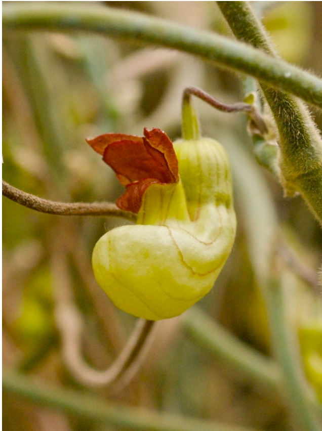
Aristolochia californica (California snakeroot) of the Aristolochiaceae (birthwort family).