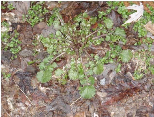
Packera glabella (butterweed).