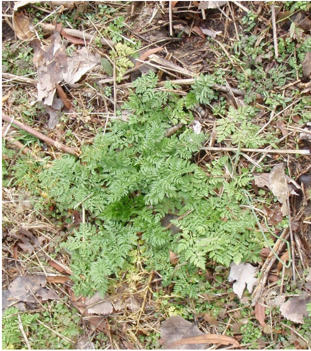
Conium maculatum (poison hemlock).