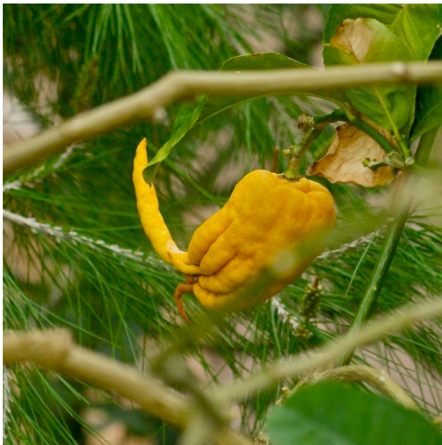
Citrus medica (Budda's hand ... 'Fingered') of the Rutaceae (Citrus family).

might convey somewhat of an idea about the shape and color of this fruit.