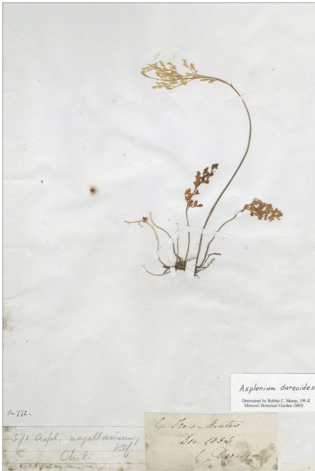
One of the Garden's rare specimens: an herbarium sheet showing a fern collected by Charles Darwin in December, 1834 while he was naturalist on the Beagle.