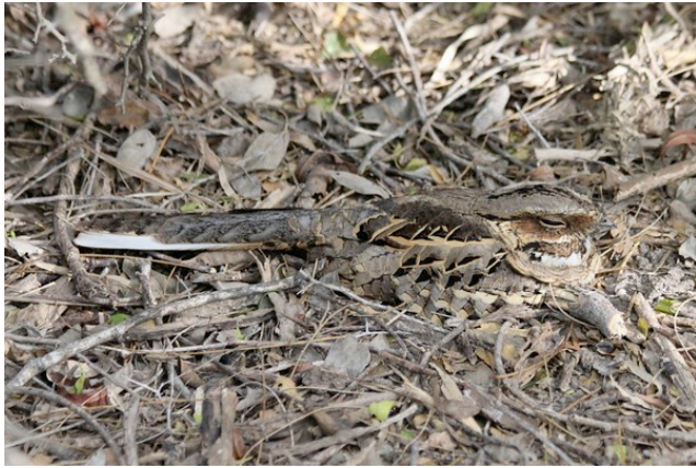
Common Pauraque in Estero Llano Grande State Park, Hidalgo Co. Texas.