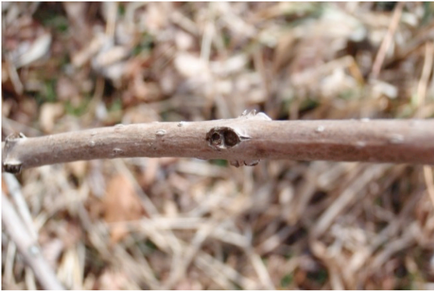
Cephalanthus occidentalis (buttonbush) showing whorl of three buds.

The future prospect for ash trees is dire. Missouri has four species of ash: green ash ( Fraxinus Americana ), white ash ( F. pennsylvanica ), blue ash ( F. quadrangulata ), and pumpkin ash ( F. profunda ).