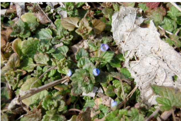
Veronica polita (speedwell) in bloom.