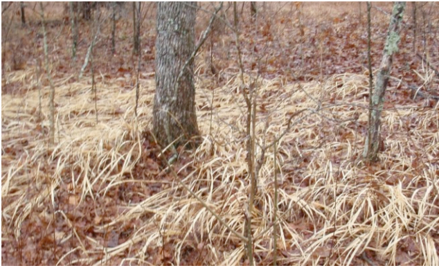
Diarrhena americana (American beakgrass).

(American beakgrass). John Oliver found the winter leaf of Aplectrum hyemale (Adam-and-Eve orchid) on a short off-trail excursion. Verbesina alternifolia (wingstem), V. virginica (frostweed), Symphoricarpos orbiculatus (coral berry), and a species of Dioscorea (probably villosa ) (wild yam) were still bearing fruits. We examined some wingstem and frostweed fruits and discussed their characteristics. Each fruit in these species is a flattened achene with bilateral wings. The fruit of V. alternifolia is roughly egg-shaped usually with broad wings, while that of V. virginica is lance-shaped with narrower wings. The promise of spring was noted not only with the blooming of Hamamelis vernalis but also the fresh green leaves of Claytonia virginica (spring beauty), and Antennaria neglecta (field pussytoes). Although the weather was decidedly unspringlike, we did sense another harbinger of spring, the calls of Hyla crucifer (spring peeper).