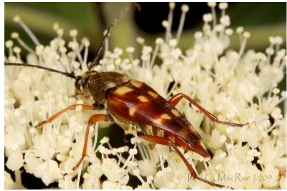
Typocerus deceptus on flower of Hydrangea arborescens .

Sacramento, I had documented 219 species and subspecies of longhorned beetles from the state – 66 of which were new state records.