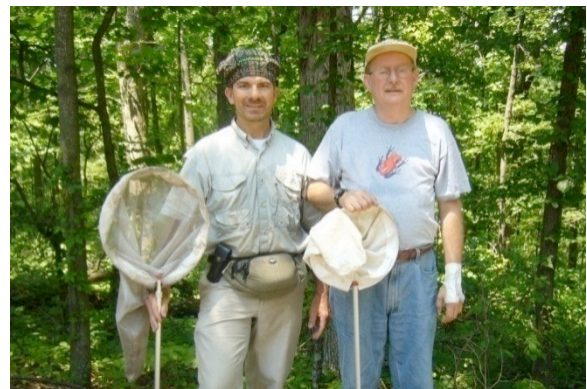
TCM with the discoverer of Typocerus deceptus in Missouri at Trail of Tears State Park, July 2008.

It is possible that T. deceptus is not as rare as it appears and is simply overlooked due to its great resemblance to another much more abundant species. However, I believe this is unlikely given its rarity in collections of eastern U.S. Cerambycidae by casual and expert collectors alike. Moreover, T. deceptus is not the only “rare” longhorned beetle to have been documented at Trail of Tears State Park – a number of other species have also been found there but not or only rarely elsewhere in Missouri (e.g., Enaphalodes cortiphagus , Hesperandra polita , Metacmaeops vittata , and Trigonarthris minnesotana ). This may be due to the unique, mesic forest found at Trail of Tears, being one of only a few sites in southeastern Missouri