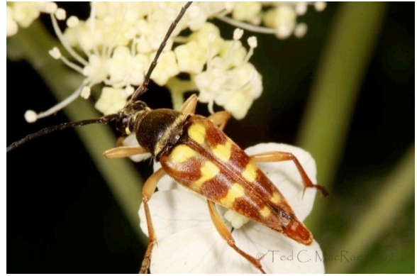
Typocerus velutinus on flower of Hydrangea arborescens .

I gradually developed a sense of the subtle differences that distinguish this species from T. velutinus and that allow its recognition in the field. Typocerus deceptus is slightly more robust than T. velutinus , and whereas the transverse yellow elytral bands of the latter are distinct and well delimited, they are weaker and often interrupted at the middle in T. deceptus , giving the beetle a slightly darker brownish appearance. The lateral margins of the elytra are also more strongly emarginated near the apices, giving the beetle a more distinctly tapered appearance. Finally, while both species possess a distinct band of dense, yellow pubescence along the basal margin of the pronotum, this band is interrupted at the middle in T. deceptus . My ability to recognize this species in the field was confirmed a few weeks ago when I returned to Trail of Tears (with longtime field companion Rich Thoma) to attempt what seemed to be an impossible task – photograph these active and flighty insects in the field on their host plants. Conditions were brutally humid, and I only saw two individuals that day – the first I immediately captured and kept alive as a backup for studio photographs should I fail to achieve my goal in the field, but the second individual (not seen until