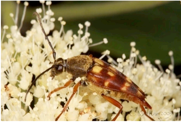
Typocerus deceptus on flower of Hydrangea arborescens .

velutinus . The similarity of T. deceptus to T. velutinus makes distinguishing individuals amongst the vastly more abundant T. velutinus quite difficult. However, Tom was able to recognize the species during his surveys as a result of prior experience with it in Illinois. As Tom and I searched the wild hydrangea plants growing along an intermittent drainage between the road and the park's unique mesic forest, we succeeded in picking out a total of four individuals of this species amongst the dozens of T. velutinus and other lepturines also feeding on the flowers.